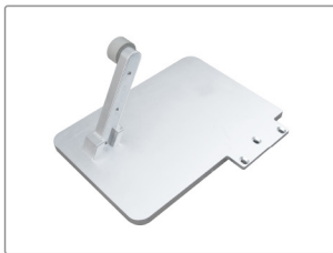
Optional Arm Post

* Table Height : Max : 892 (mm) Min : 766 (mm)