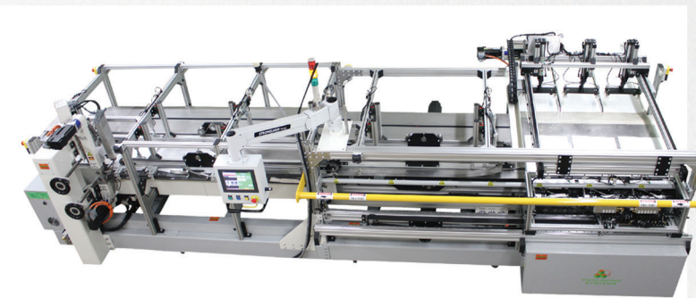
Seal Type: Folded Closure