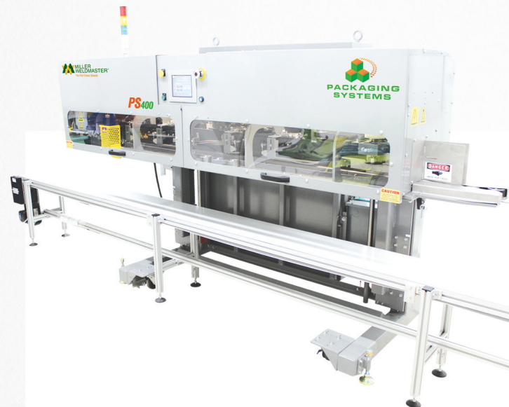
Seal Type: Pinch Closure and Double Fold Closure