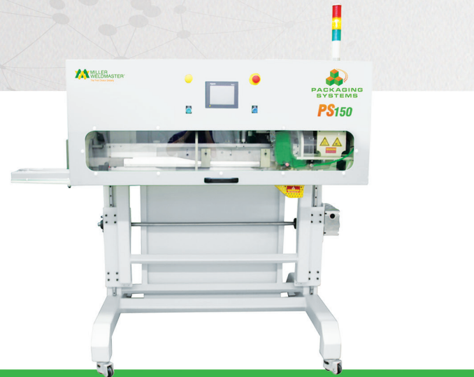
Seal Type: Pinch Closure