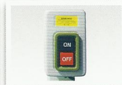
SEPARATE CONTROL SWITCH