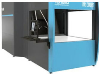
THE LASER TM TABLE AND MANNEQUIN LASER MACHINE