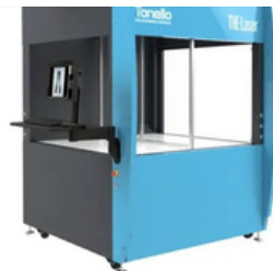
THE LASER T TABLE LASER MACHINE